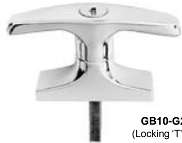
GB10-G24517 (Locking 'T' handle)