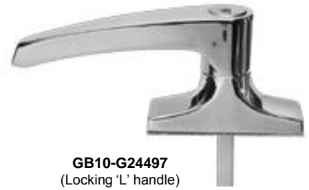
GB10-G24497 (Locking 'L' handle)